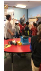
School Committee Meeting