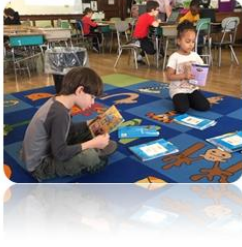
School Committee Meeting