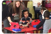
School Committee Meeting