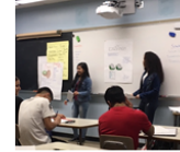
School Committee Meeting