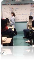
School Committee Meeting