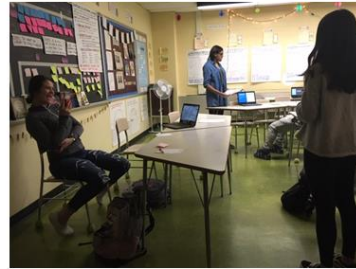
School Committee Meeting